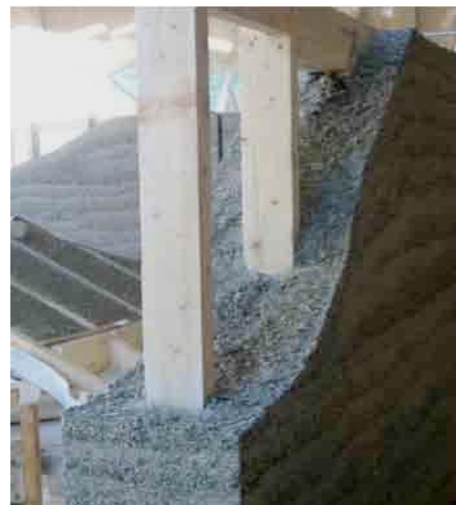
Fig 6: Lime-hemp on a timber frame