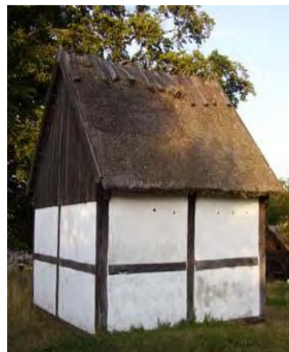
Fig 2: Half-timber house Sweden

Roman cement is an ancient building material where a bonding agent such as lime is combined with pozzolans and fibrous organic material to improve tensile strength and prevent cracking of the material. This concept has been used and proven durable through time over the last millennia. Cato (234- 149 B.C)The mix that Cato described over 2 millennia age combines lime, aggregate such as stone, earth and sand, and straw as fibrous organic material in mix with water. The use of lime in building structures dates back even further than that. According to Adam (1994) [23] , lime was already used in Asia Minor in the sixth millennium B.C.