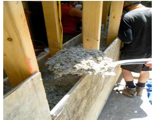
Fig 4: Construction methods step by step

openings will take extra time to form. Avoid having this formwork protrude beyond the face of the wall to avoid interfering with slip forms when they are placed in these areas. 7. Interior and exterior corners require secure attachment for forms, especially when centered framing and spacers are being used.