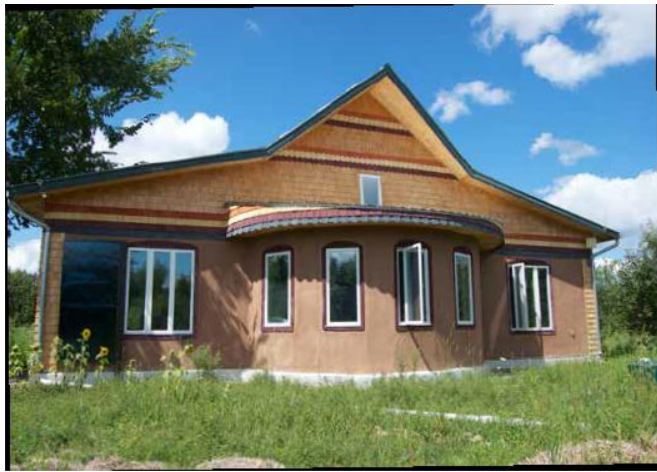
Fig7: Hempcrete home or house