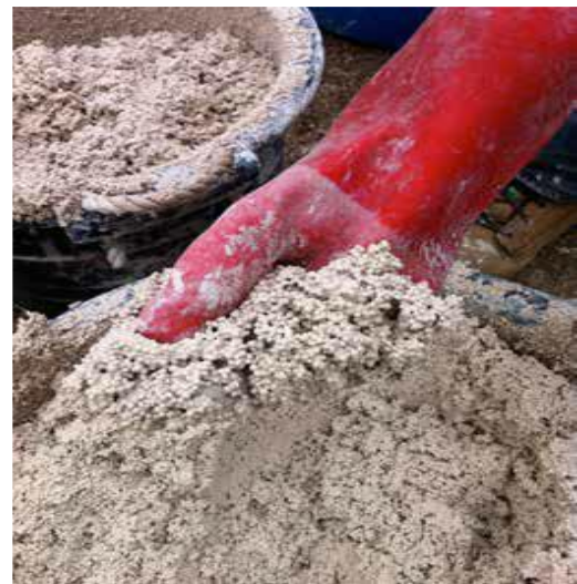
Fig 5: Lime-hemp mix